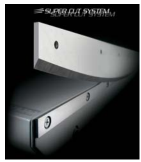
SUPER CUT SYSTEM Carbon hardened steel blades and counter-blades with 65° sharpening for long-lasting cutting operations